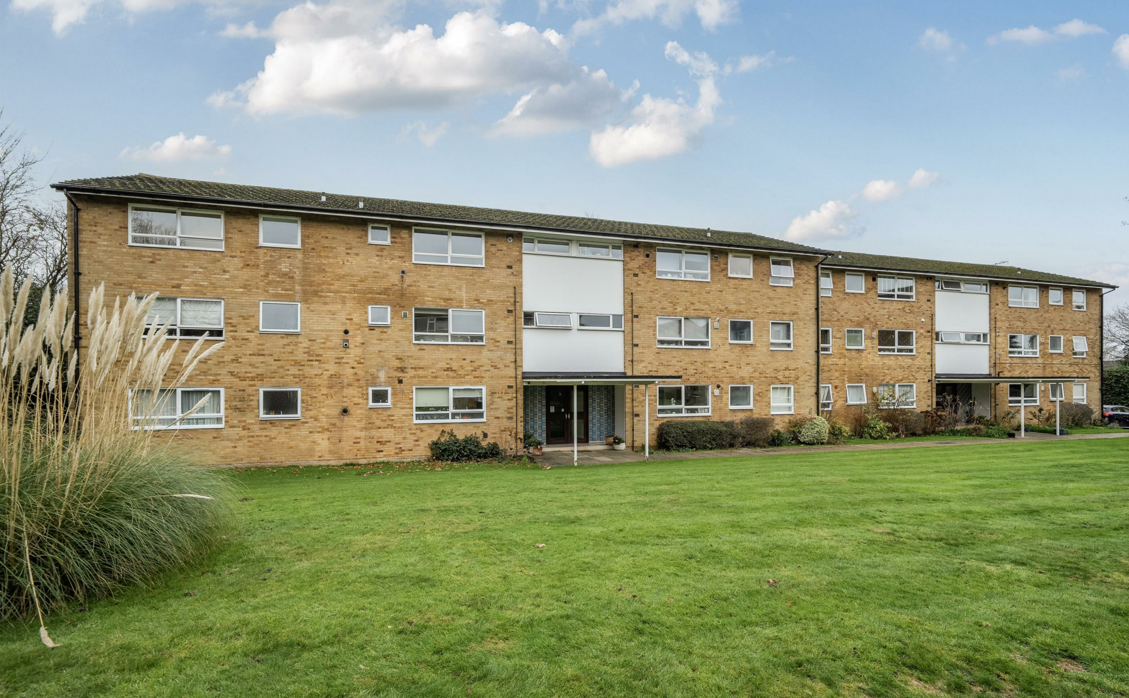
41 The Shimmings, Boxgrove Road, Guildford, Surrey, GU1 2NQ CLARKE C·G GAMMON 1919