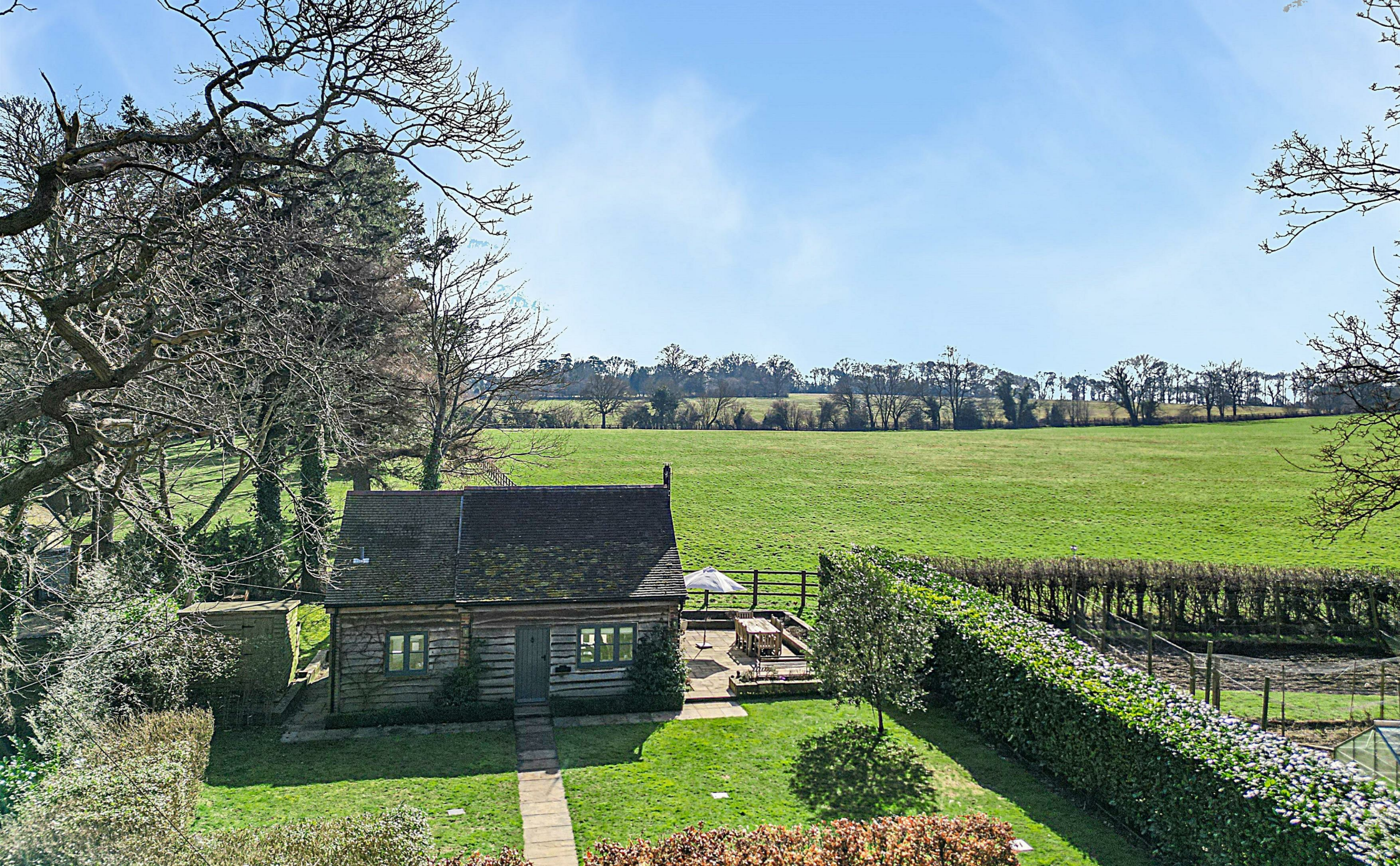
The Wendy House, Haslemere Road, Godalming, Surrey GU8 5PT Freehold