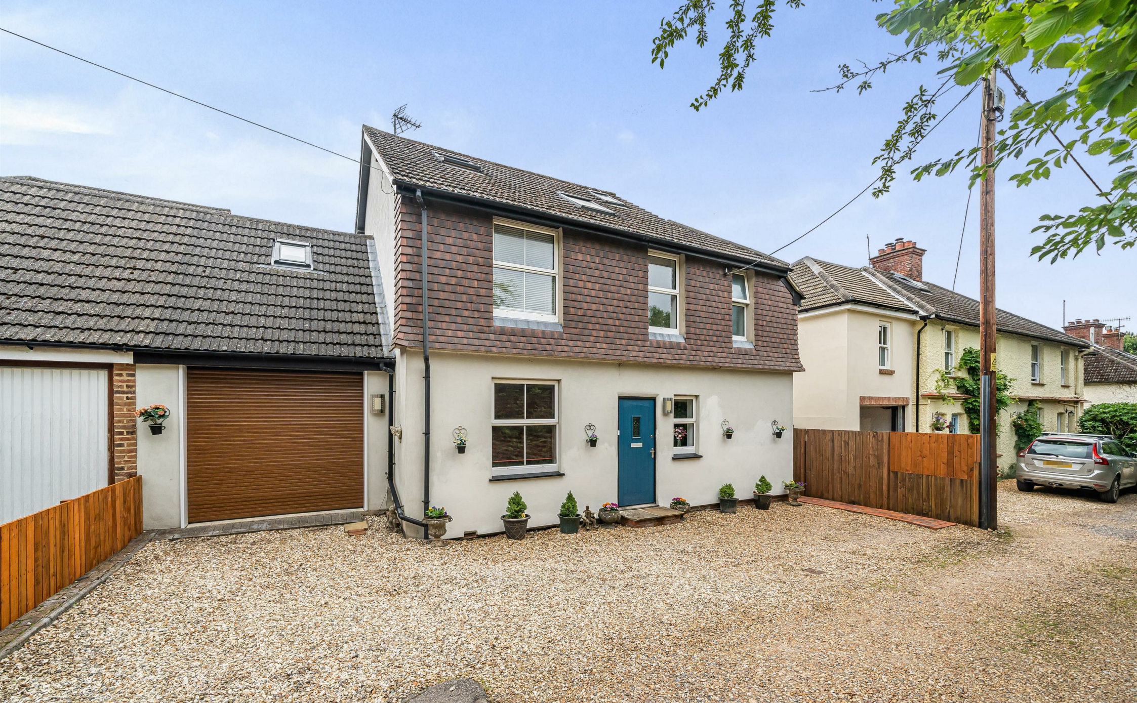
Hazelbank, Covers Lane, Hammer Vale, Haslemere, Surrey Freehold