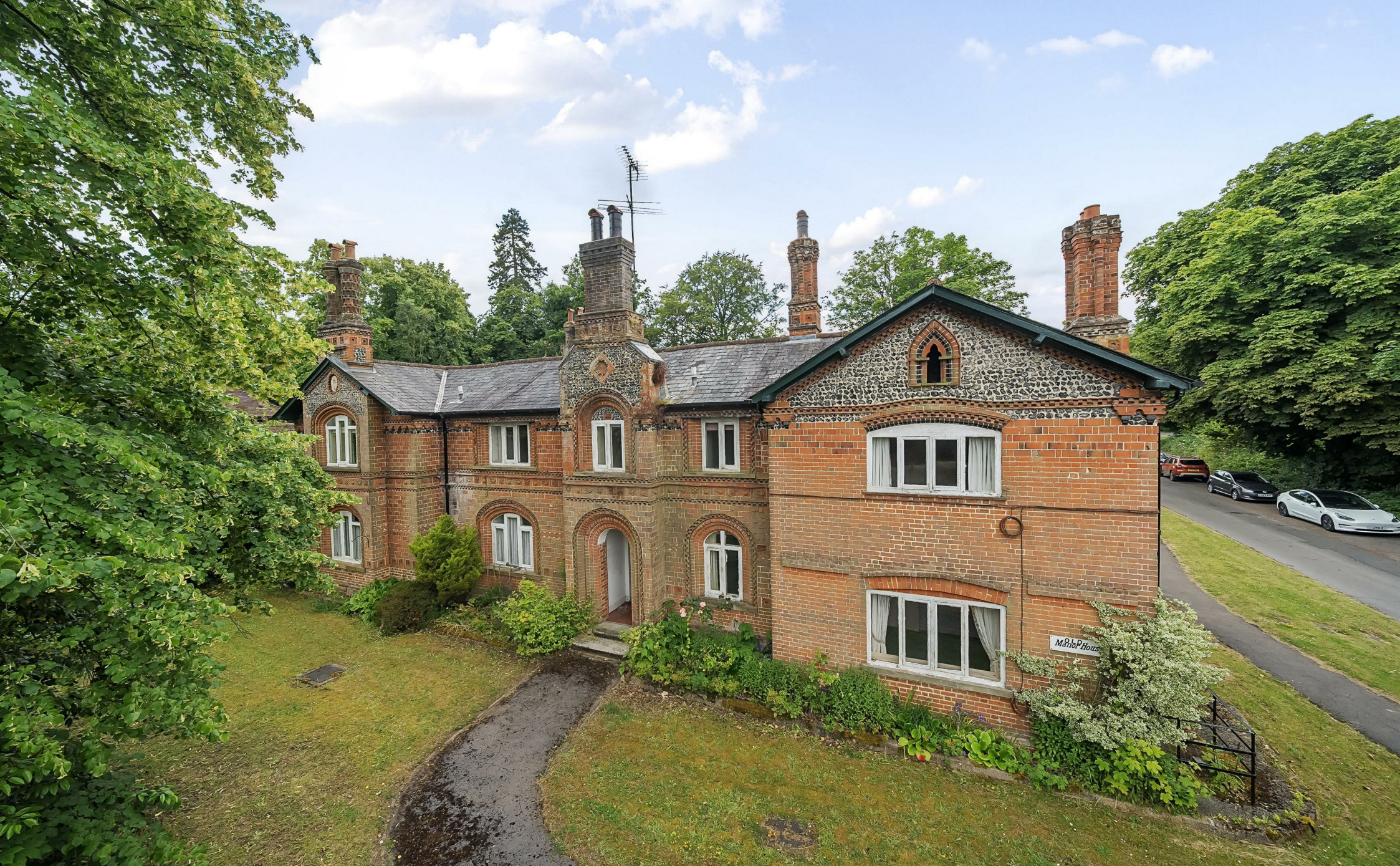
'The Old Manor House', Ockham Road South, East Horsley, Nr. Leatherhead, Surrey, KT24 6RN