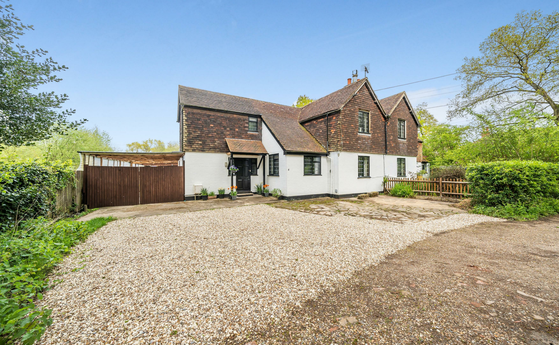
4 Littlefield Cottages, Littlefield Common, Guildford, GU3 3HH