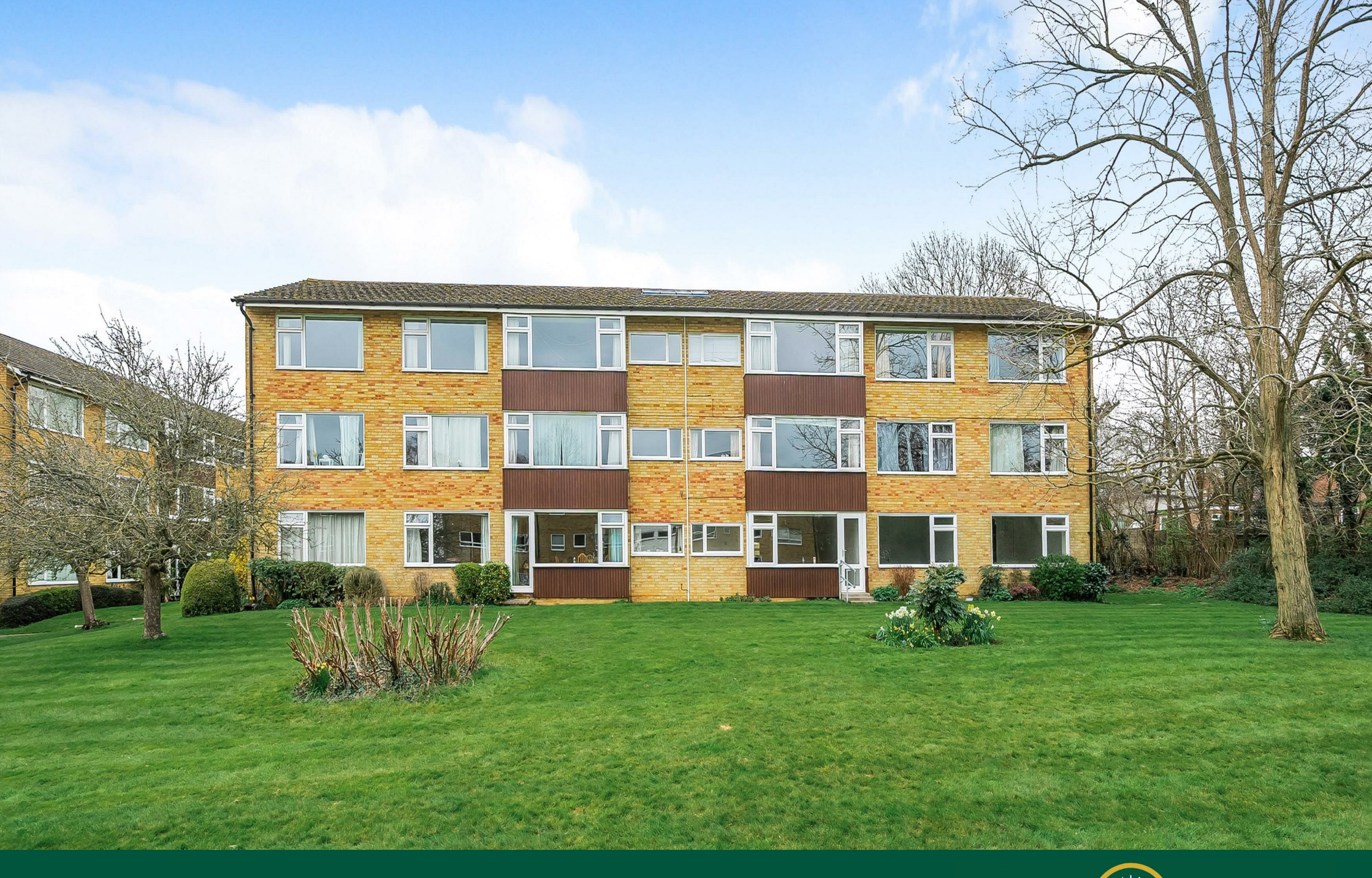
Flat 24 - The Shimmings, Boxgrove Road, Guildford, Surrey, GU1 2NG