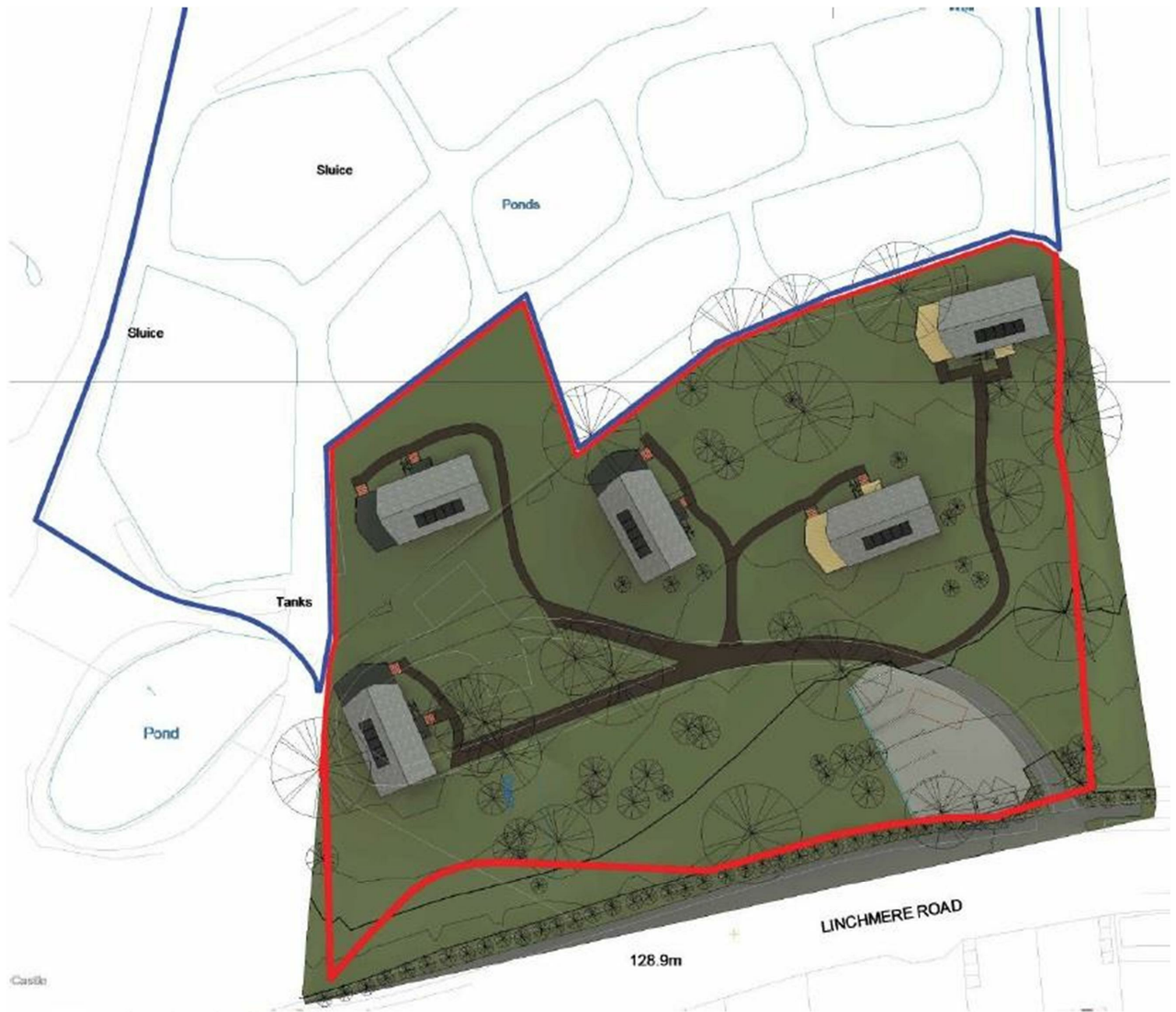
Illustrative Site Plan