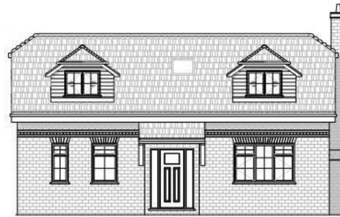
PROPOSED SOUTH WEST (FRONT) ELEVATION 1:50