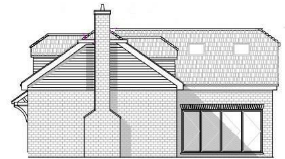
PROPOSED SOUTH EAST (SIDE) ELEVATION 1:50