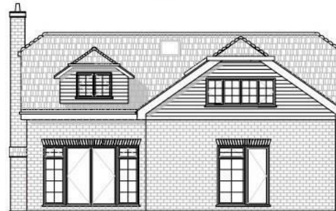
PROPOSED NORTH EAST (REAR) ELEVATION 1:50