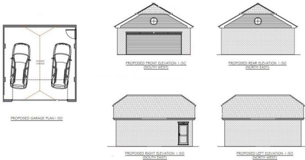
PROPOSED GARAGE PLAN 1:50