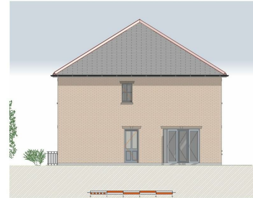
S Proposed Side Elevation 1:100