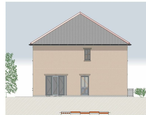
N Proposed Side Elevation 1:100

NEIL WARNER © 2017 NEIL WARNER ARCHITECTURE ALL RIGHTS RESERVED