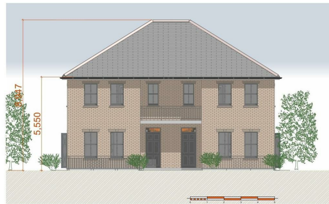
W Proposed Front Elevation 1:100