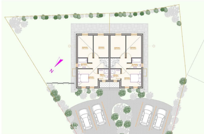
Proposed First Floor Plan 1:100