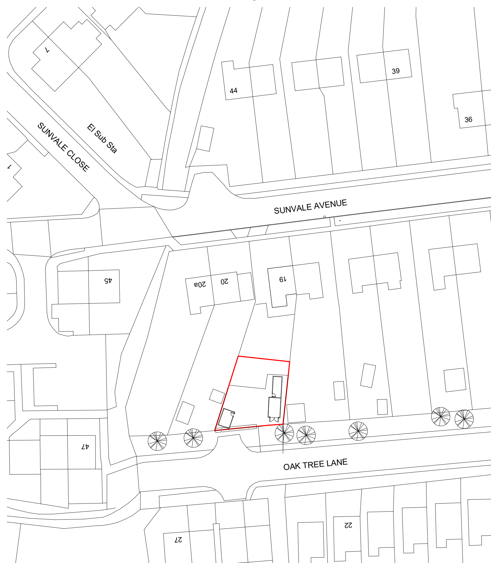
2 Existing Site Location Plan GA(10)002 1 : 1250