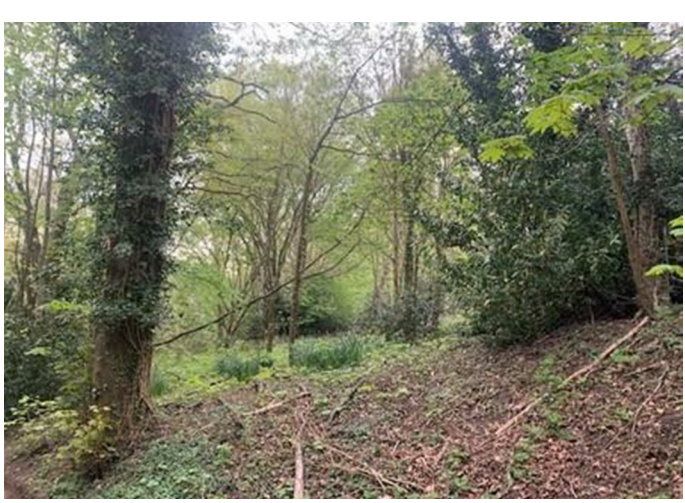
THE GROUNDS Type your text here