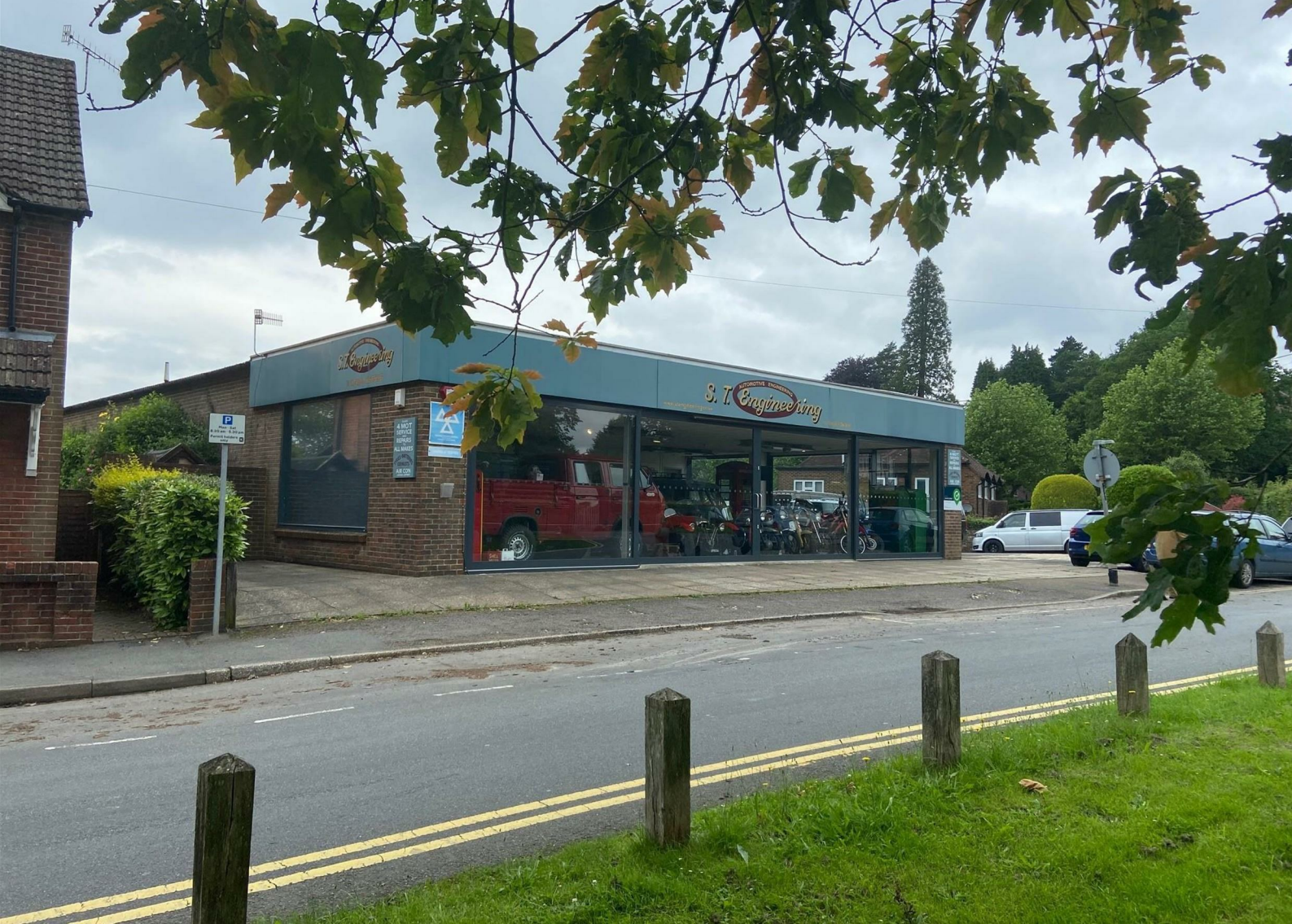
S T ENGINEERING, ST. CHRISTOPHERS GREEN, HASLEMERE, SURREY, GU27 1DG