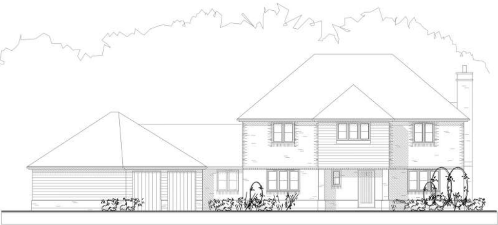
FRONT ELEVATION - North PLOT 2