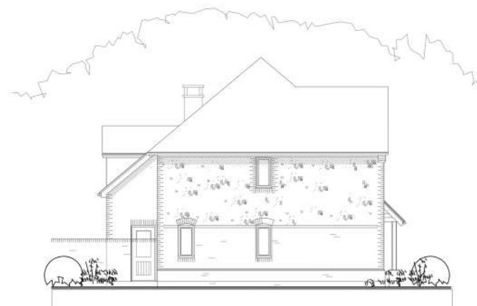
SIDE ELEVATION - North