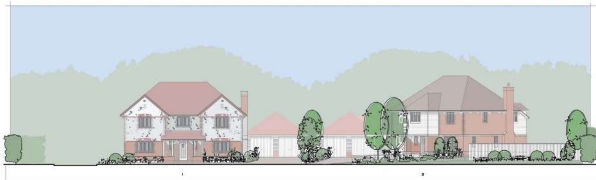
STREET ELEVATION - WEST - Plots 1 & 2