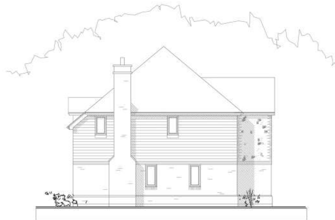
SIDE ELEVATION - South