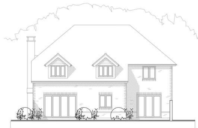
REAR ELEVATION - East