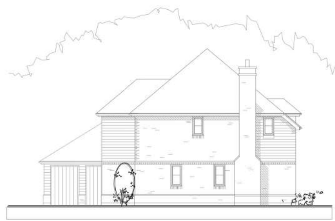
SIDE ELEVATION - West