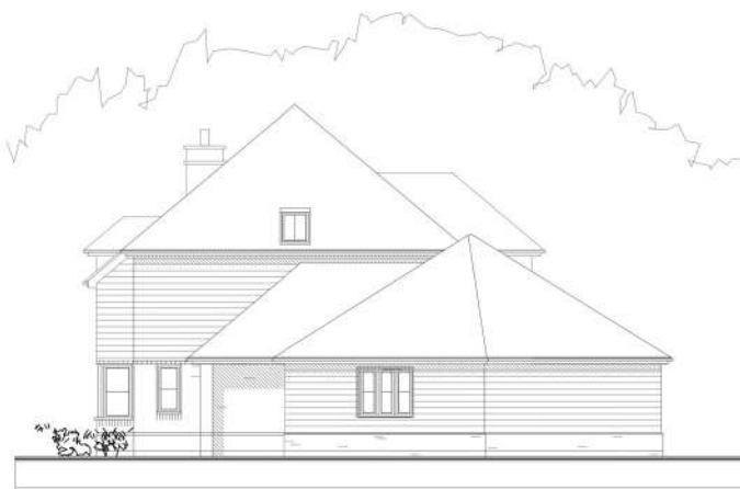
SIDE ELEVATION - East