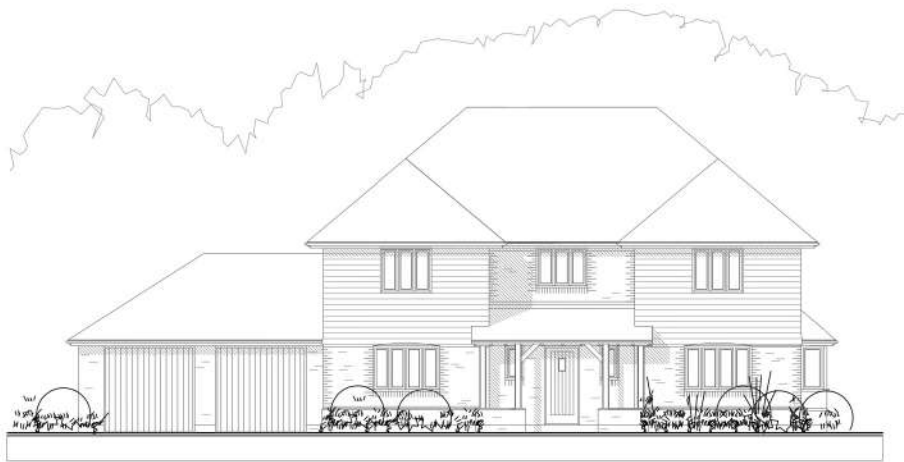
FRONT ELEVATION - North PLOT 4