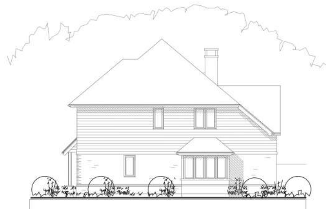
SIDE ELEVATION - East