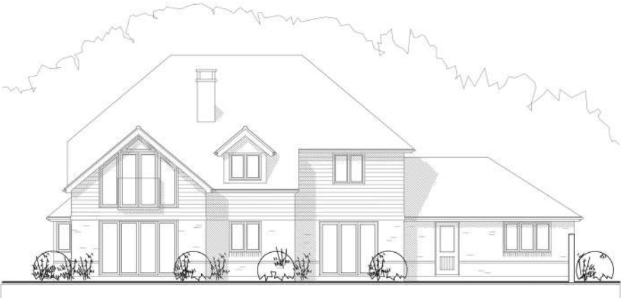
REAR ELEVATION - South