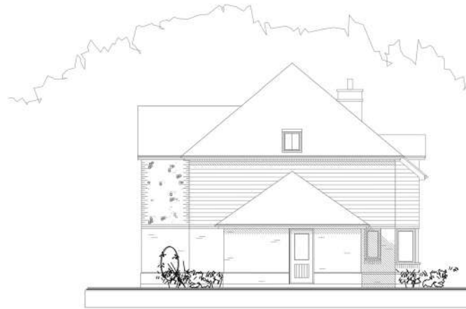
SIDE ELEVATION - North