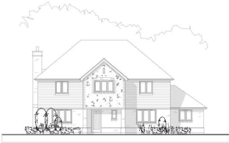
FRONT ELEVATION - East PLOT 3