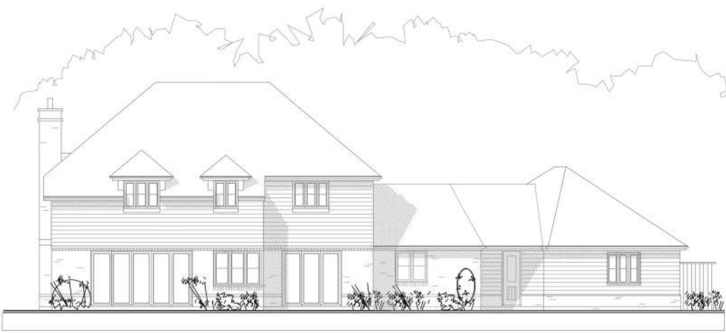
REAR ELEVATION - South