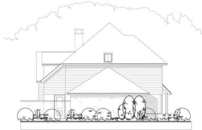
SIDE ELEVATION - West