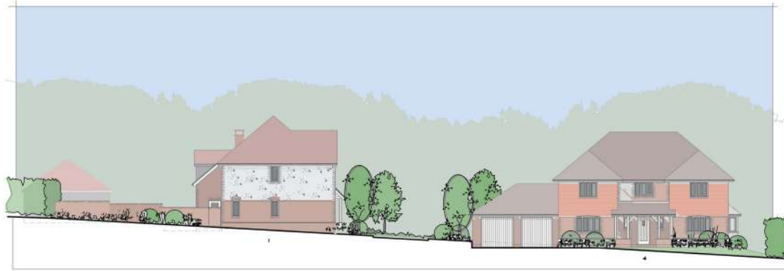
STREET ELEVATION - NORTH - Plots 1 & 4