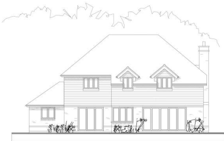
REAR ELEVATION - West