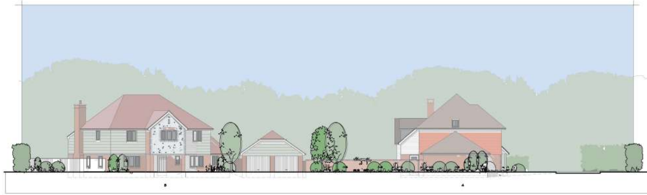
STREET ELEVATION - EAST - Plots 3 & 4