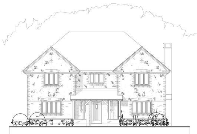
FRONT ELEVATION - West PLOT 1