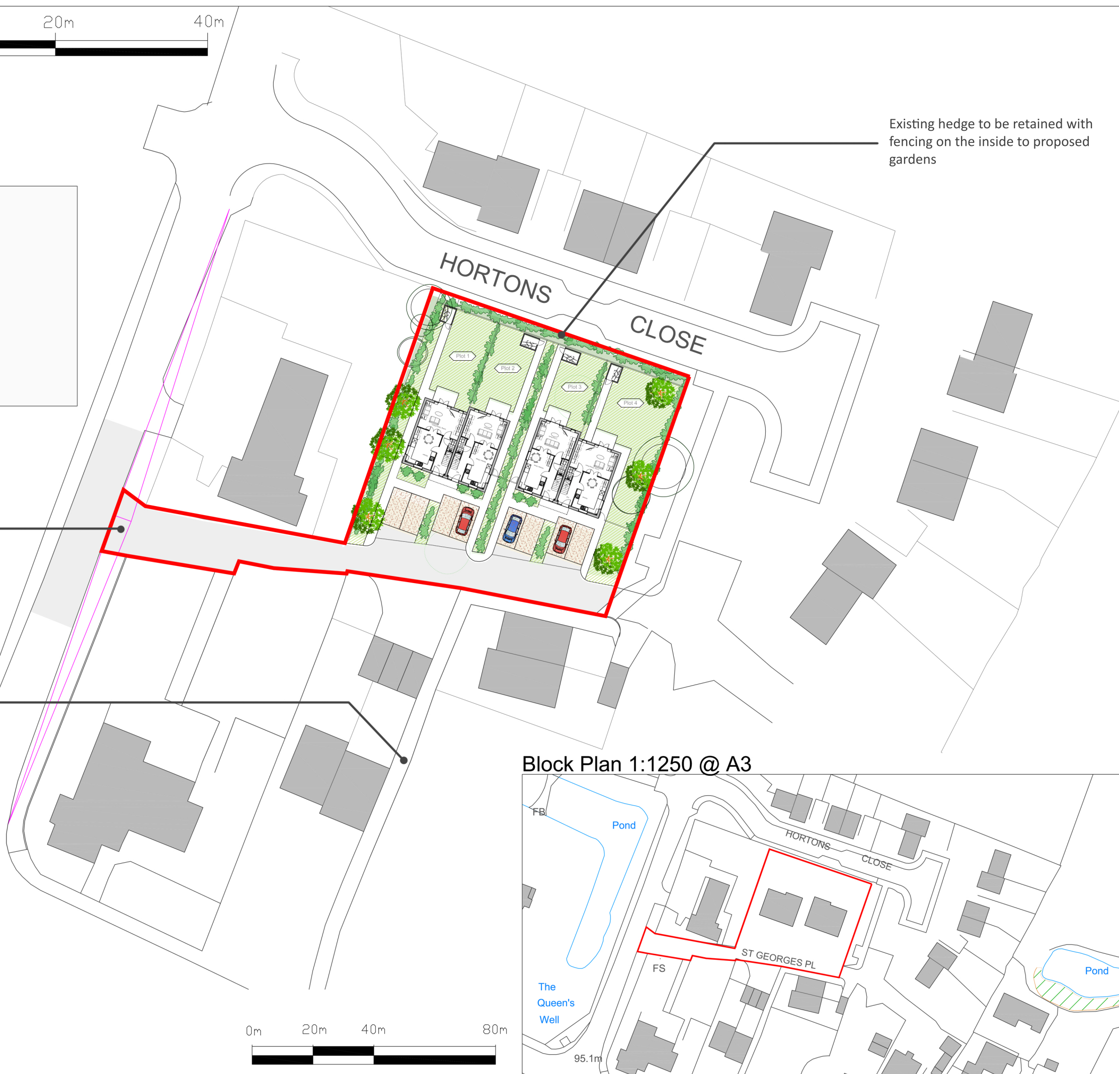
Block Plan 1:1250 @ A3

Existing hedge to be retained with fencing on the inside to proposed gardens