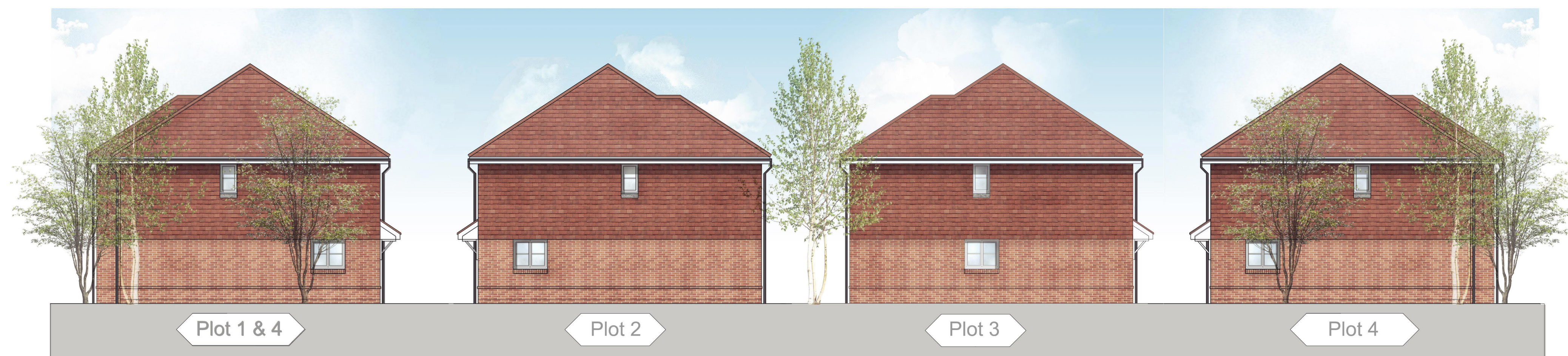
Plot 1: West Elevation