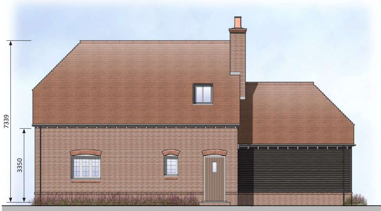
2. Proposed Rear Elevation