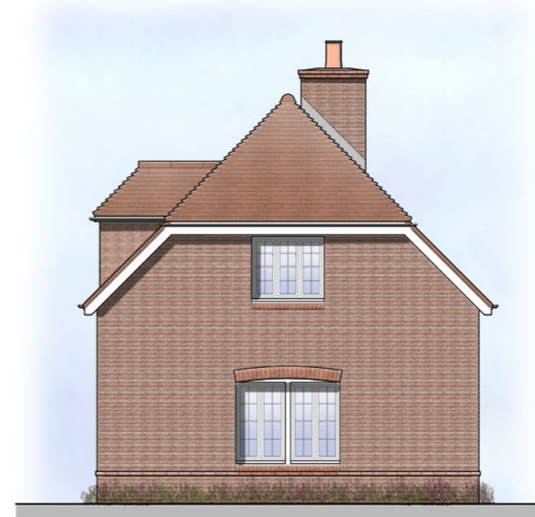
4. Proposed Side Elevation