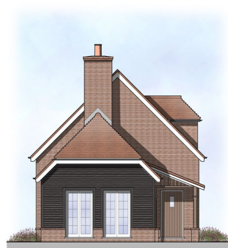
3. Proposed Side Elevation