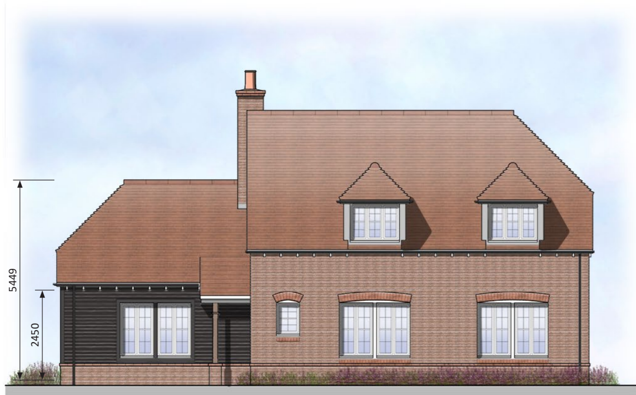
1. Proposed Front Elevation