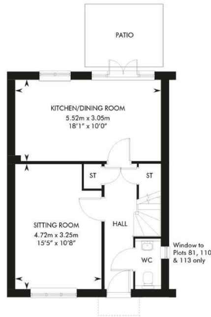
GROUND FLOOR OPTION 1 PLOTS 81, 84, 87, 110 & 113

THE BROOK - CUSTOM BUILD PLOTS 81, 83, 85, 87, 109, 110, 111, 112, 114 & 115 - AS SHOWN PLOTS 82, 84, 86, 88 & 113 - HANDED